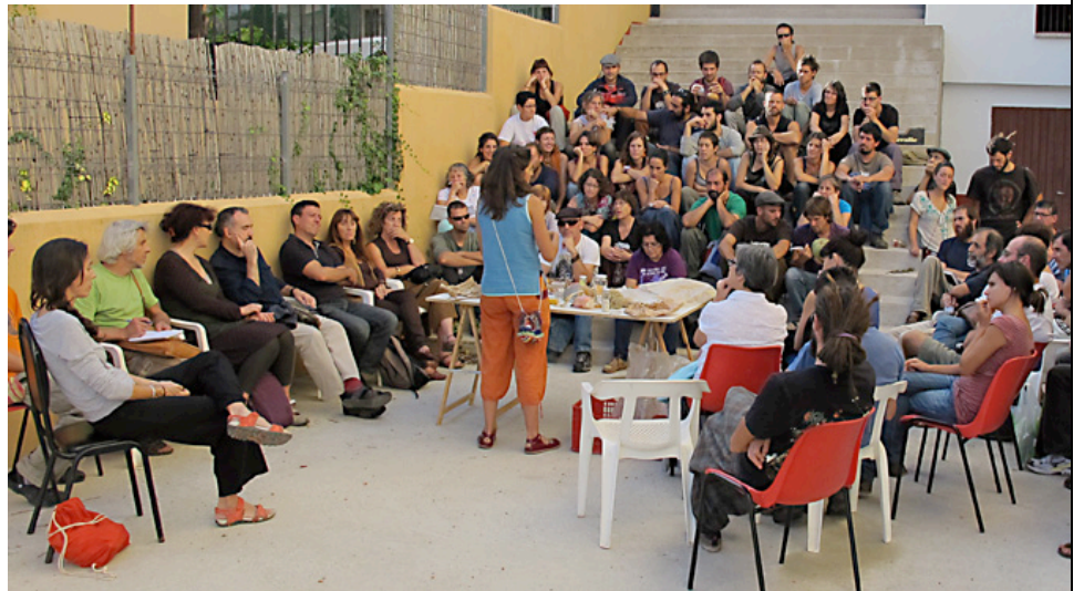
Photo 2. Workshop in local seed production.