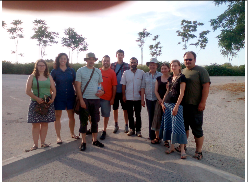
Photo 1. Participating group at final meeting.